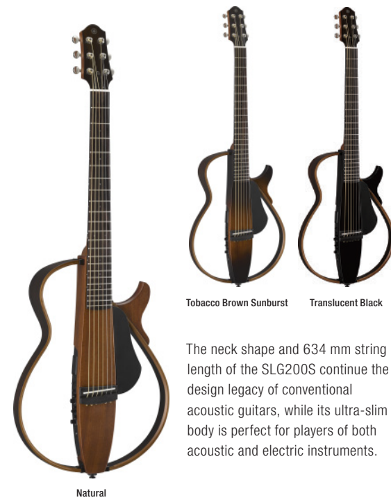
Tobacco Brown Sunburst Translucent Black

The neck shape and 634 mm string length of the SLG200S continue the design legacy of conventional acoustic guitars, while its ultra-slim body is perfect for players of both acoustic and electric instruments.