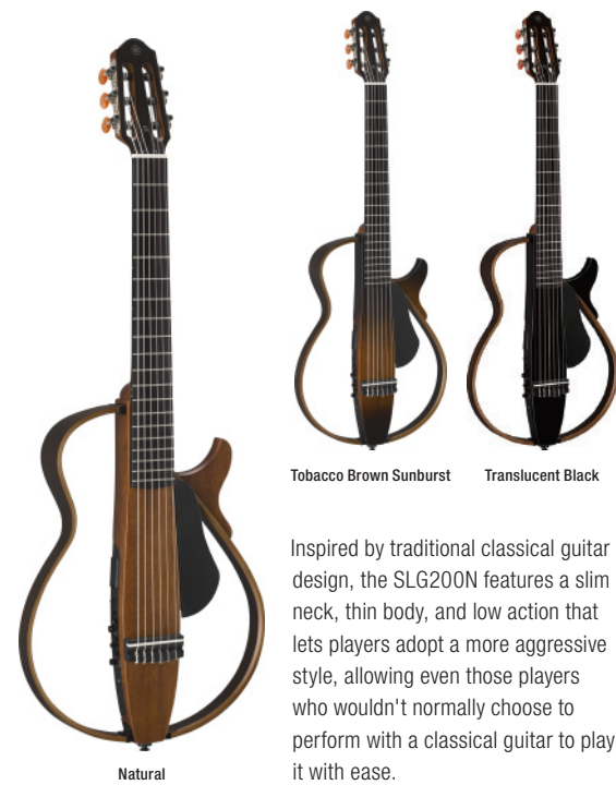
Tobacco Brown Sunburst Translucent Black

Inspired by traditional classical guitar design, the SLG200N features a slim neck, thin body, and low action that lets players adopt a more aggressive style, allowing even those players who wouldn't normally choose to perform with a classical guitar to play it with ease.