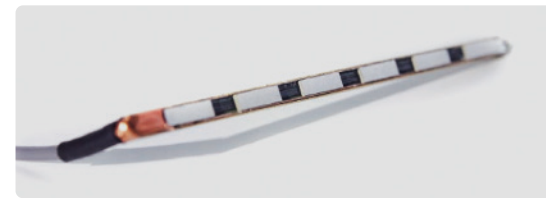
SRT Pickup (Under Saddle type)